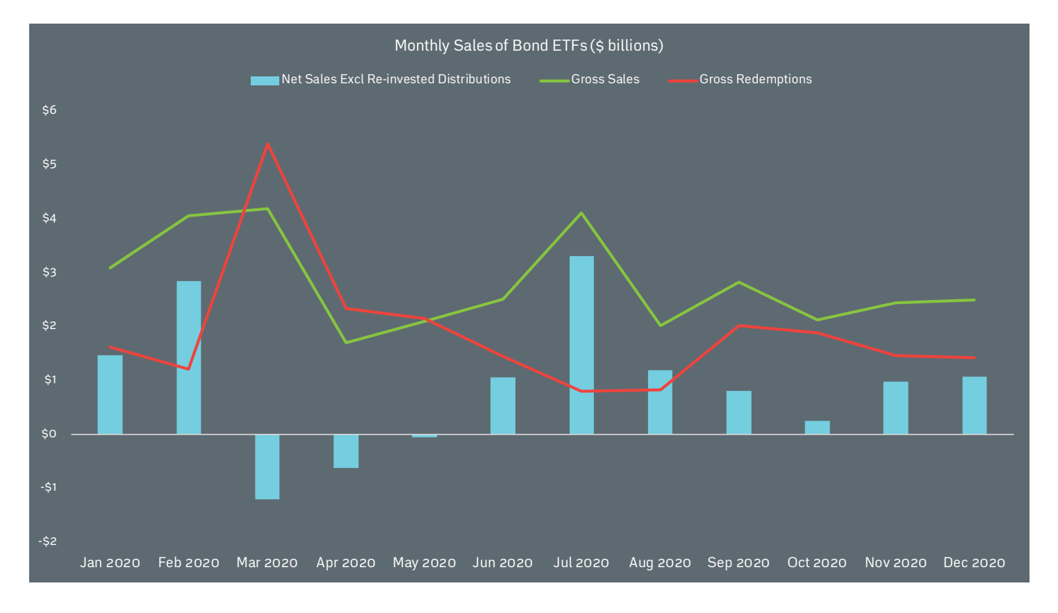
Chart 3 - Bond ETF Sales

Investors did not halt their purchases during the most stressed periods. In fact, when gross redemptions were at their highest in March 2020, gross sales were also at their highest suggesting that instead of running for the exits, many investors saw the price declines as a buying opportunity.